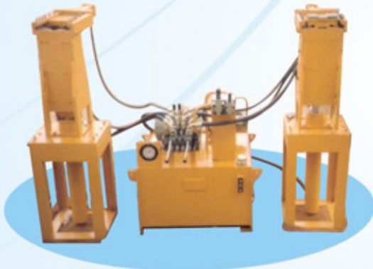
Inter Lock Brick Making Machine