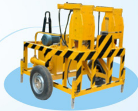
Machine with mobile trolley